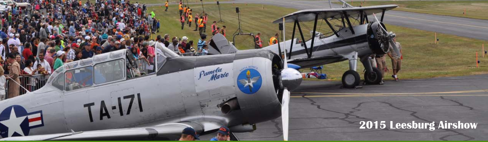
2015 Leesburg Airshow