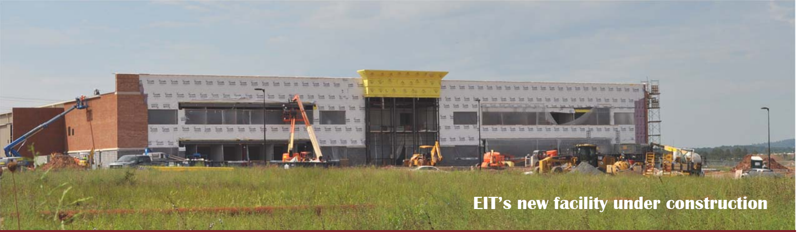
EIT's new facility under construction