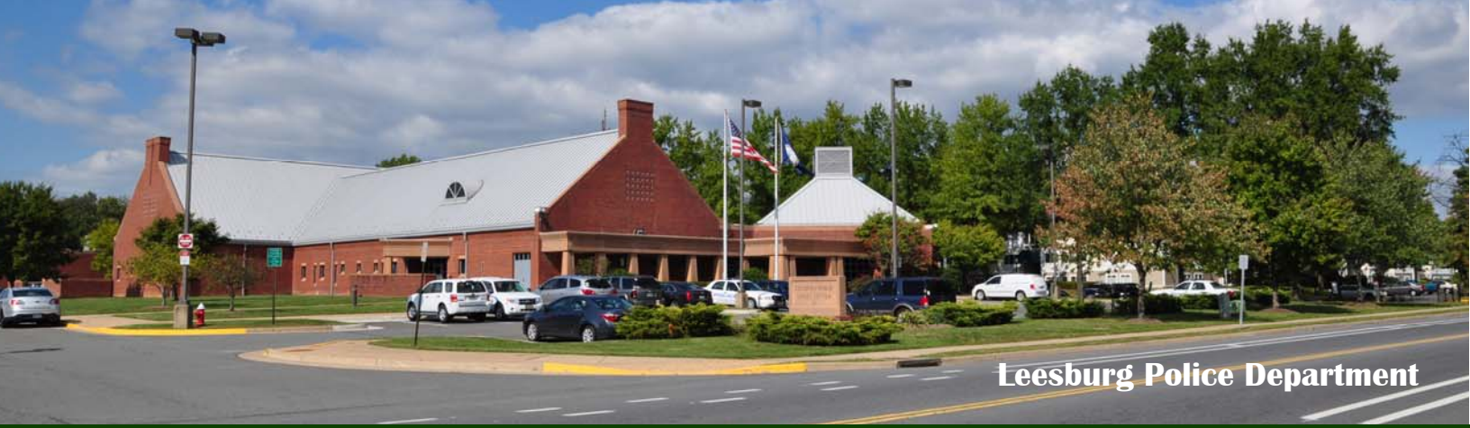
Leesburg Police Department