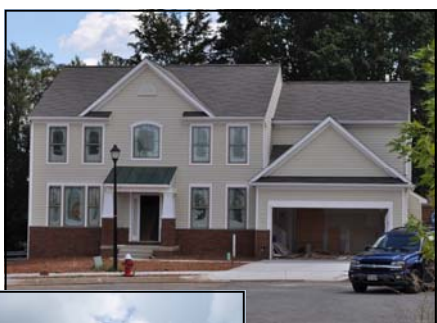
Valley View Estates