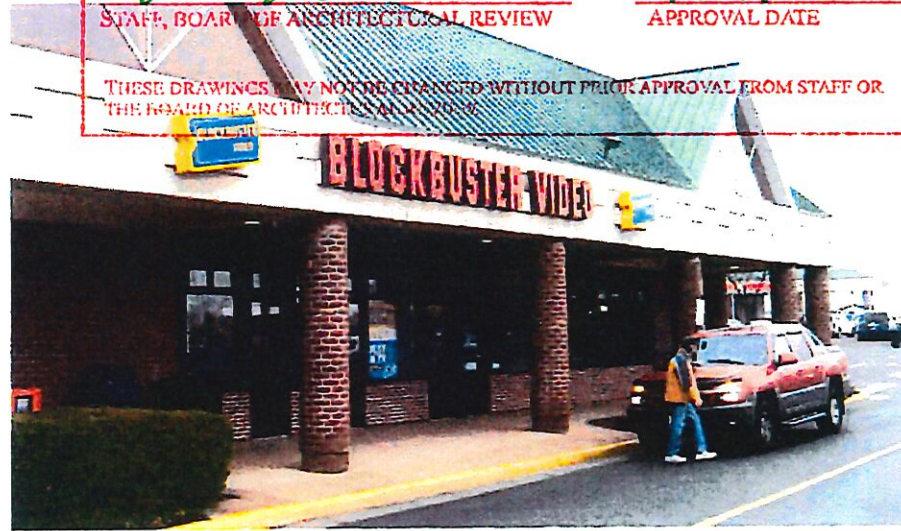
Former Blockbuster – Used as example for Tenants other than Anchor Tenant

THESE DRAWINGS MAY NOT BE CHANGED WITHOUT PRIOR APPROVAL FROM STAFF OR THE BOARD OF ARCHITECTURAL REVIEW