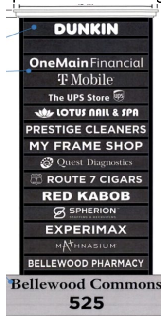
TLSP-2022-0165 Monument Sign