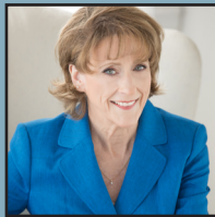
MAYOR Kelly Burk