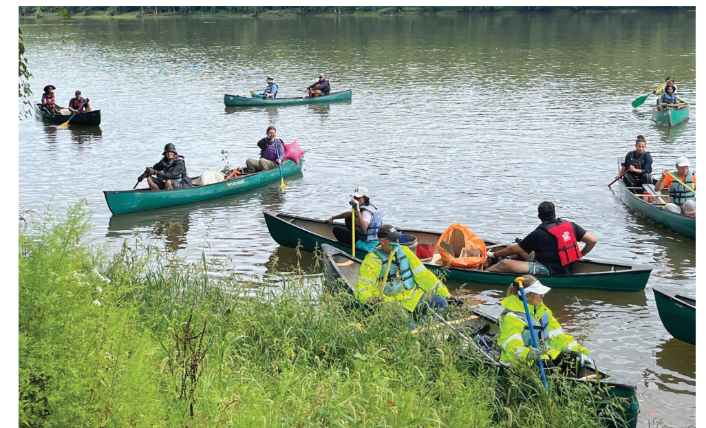
Potomac River Clean Up Day.